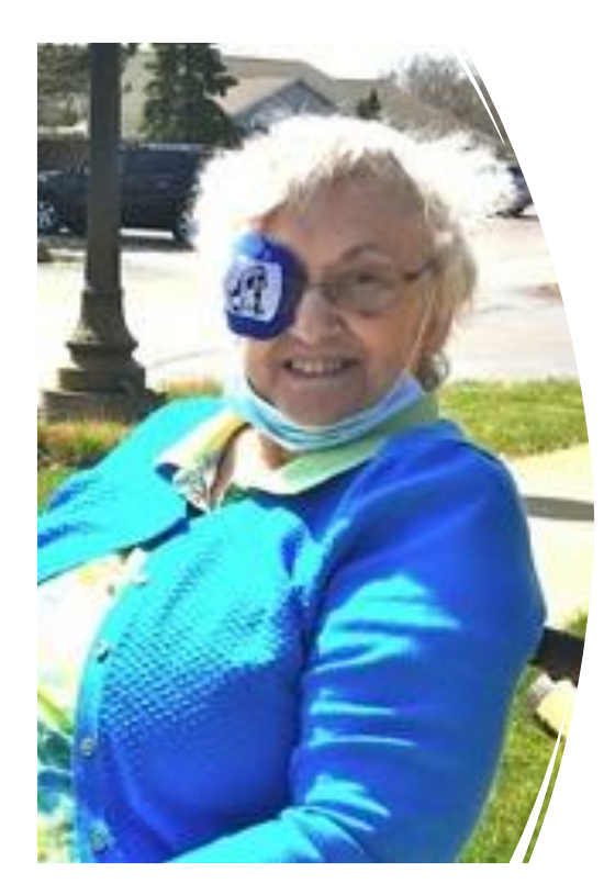
Mom, 2 weeks before her passing and 1 week before willful act of cruelty.